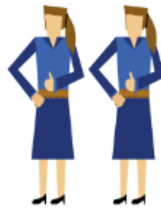
one woman-two women