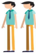
one man-two men